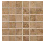
1093170 2"x2" Mosaic (12"x12")