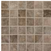
1093278 2"x2" Mosaic (12"x12")